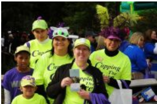
Team "CAMBRIDGE COURT" "CAPPING THE CURE" to stomp out Alzheimer's. The 2010 Annual Memory Care Walk was held at the Dallas Zoo on Saturday, Nov. 13, 2010. Cambridge Court staff and residents raised money by hosting many events such as a garage sale, bake sale, Frito pie sale, wear your jeans to work day and competing with other team members to raise the most donations.

"To give without any reward, or any notice, has a special quality of its own." —Anne Morrow Lindbergh